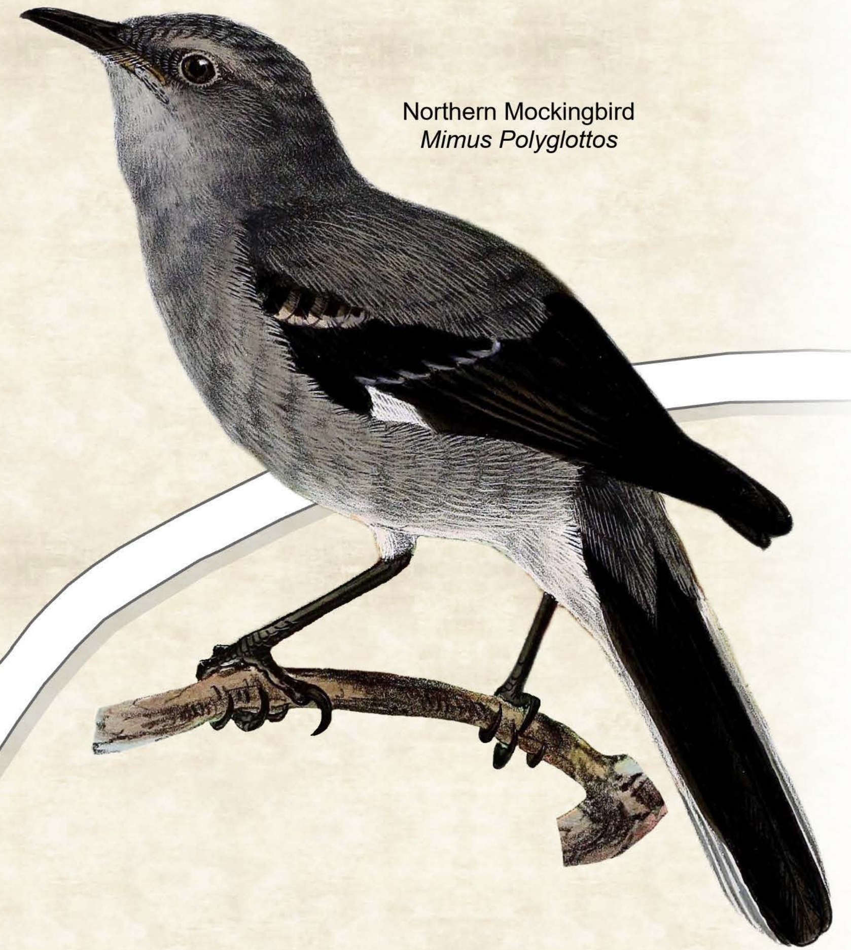
Northern Mockingbird Mimus Polyglottos