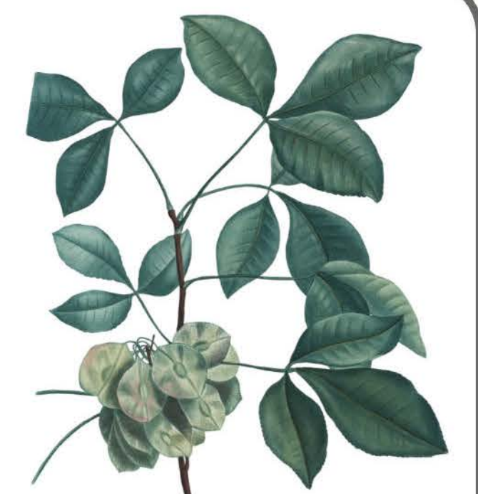
Common Hoptree Ptelea trifoliata