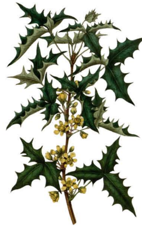
Agarita Berberis trifoliolata