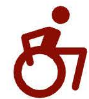
Paved trails meet ADA accessibility standards