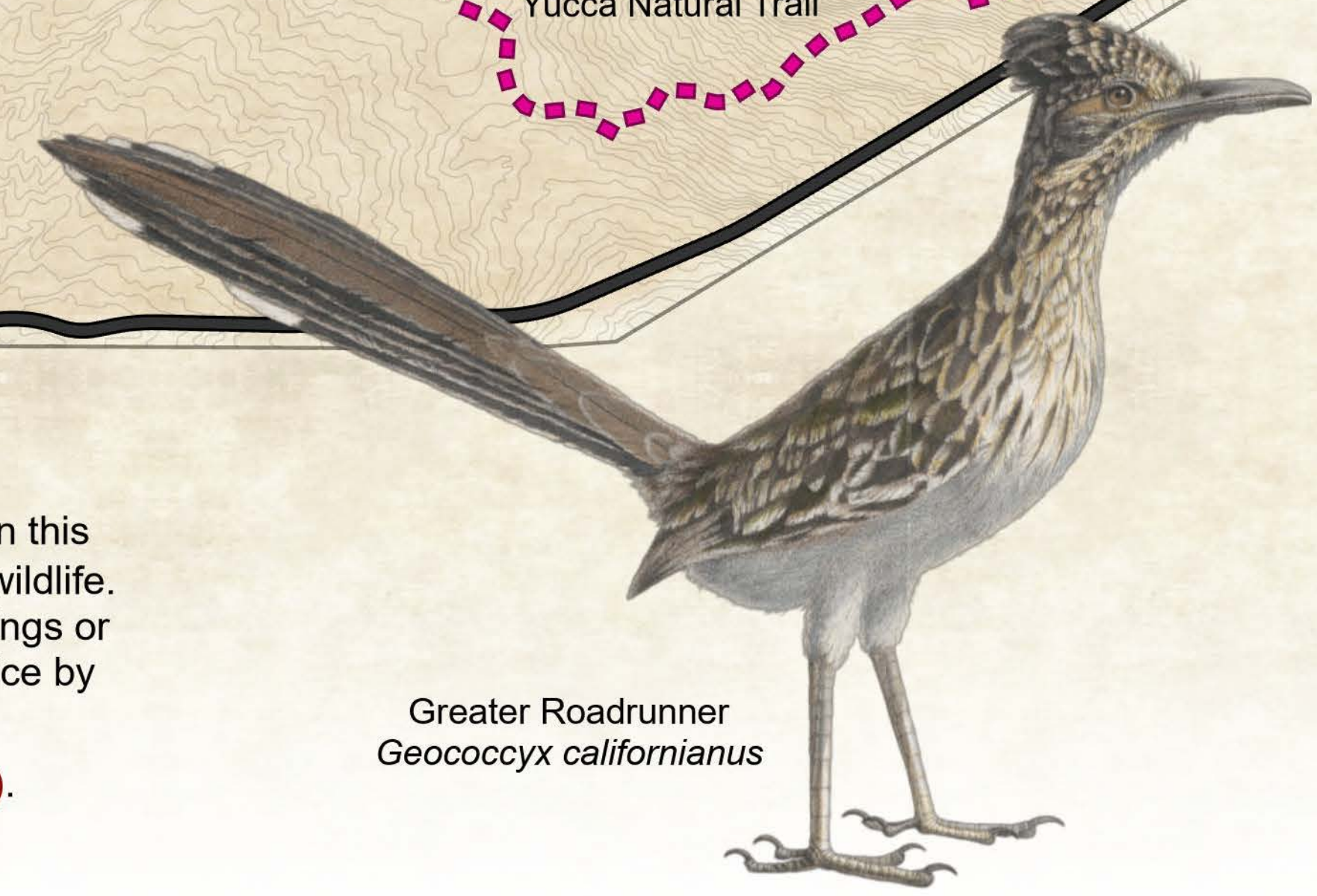
Greater Roadrunner Geococcyx californianus

Caution: Beware of wildlife in this natural area. Do not approach wildlife. Report any mountain lion sightings or dangerous wildlife to Park Police by calling 210-207-8590 (non-emergency line) .