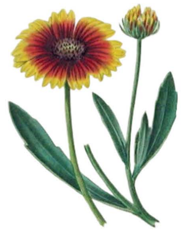
Firewheel Gaillardia pulchella