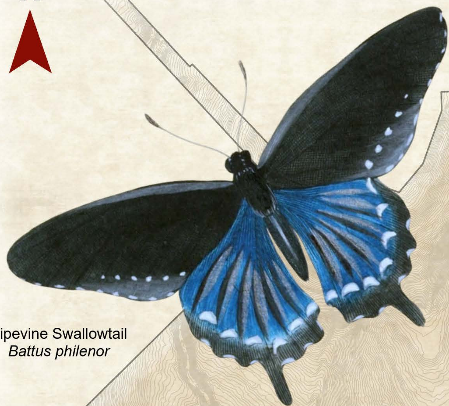
Pipevine Swallowtail Battus philenor

7222 Luskey Blvd. San Antonio, TX 78256 (210) 207-5323 sa.gov/parksandrec