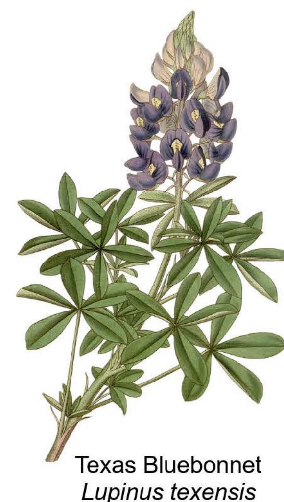
Texas Bluebonnet Lupinus texensis