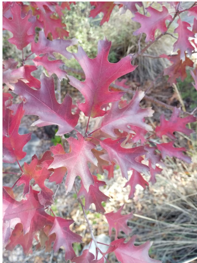
Red Oak, Quercus buckleyi

Be sure to look out for poison ivy that is easier to see as the leaves turn color.